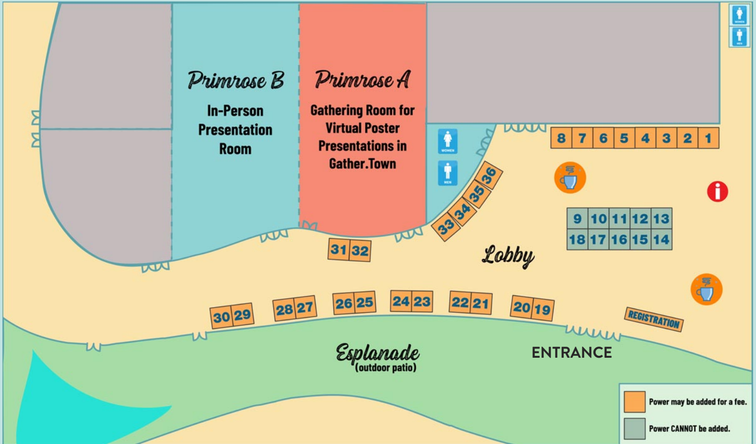
EXHIBIT DATES & TIMES